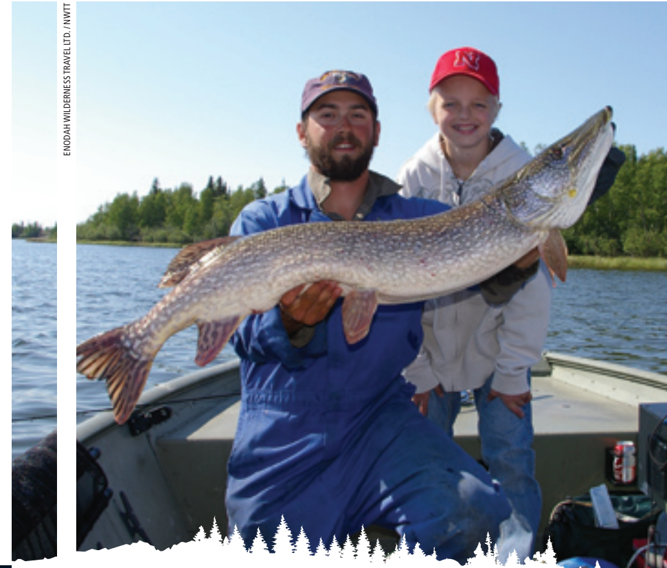
ENODAH WILDERNESS TRAVEL LTD. / NWTT

The Northwest Territories features lodges and guides offering a variety of superb fishing experiences. Choose the comforts of a cozy cabin on a private lake, with home-