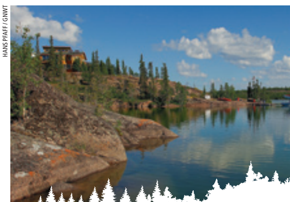
HANIS PFAFF / GNWT