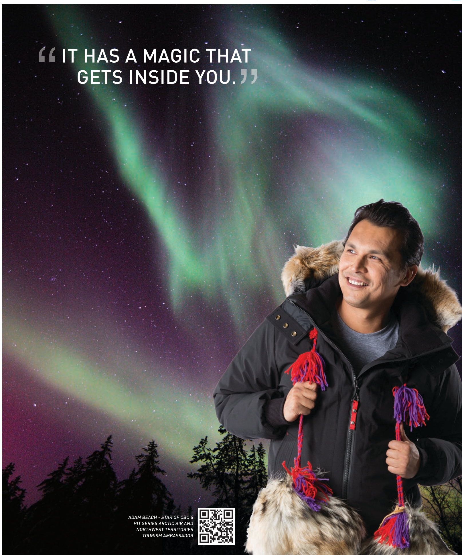
ADAM BEACH - STAR OF CBC'S HIT SERIES ARCTIC AIR AND NORTHWEST TERRITORIES TOURISM AMBASSADOR