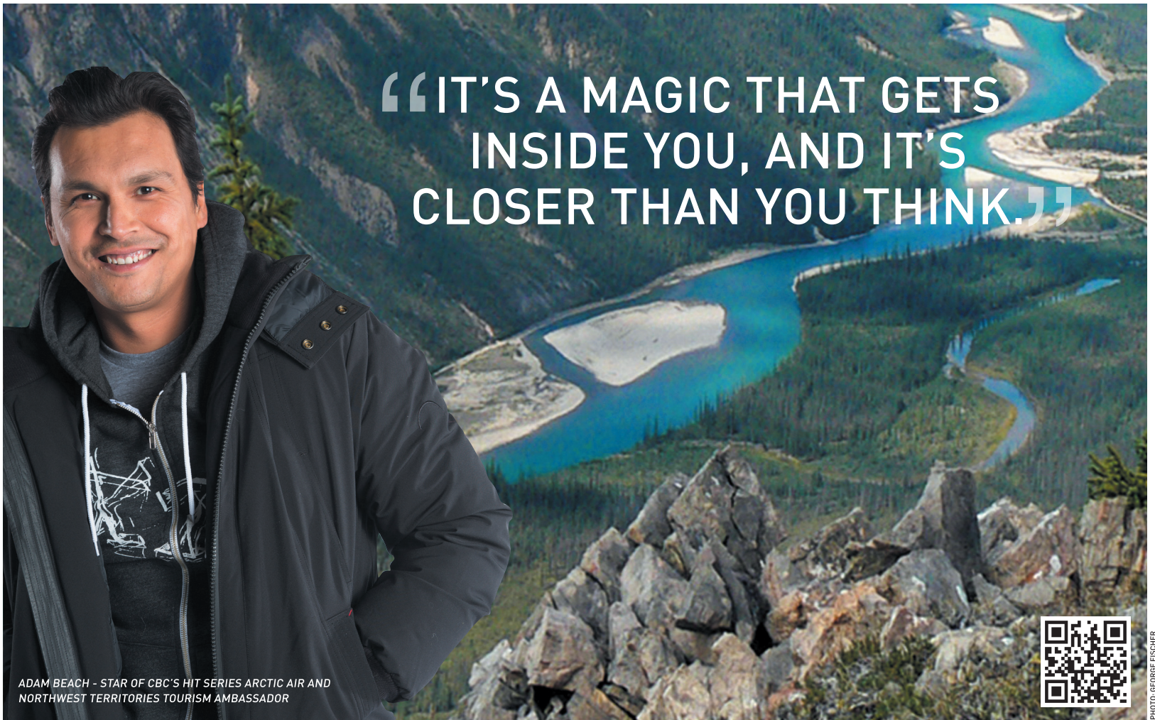
ADAM BEACH - STAR OF CBC'S HIT SERIES ARCTIC AIR AND NORTHWEST TERRITORIES TOURISM AMBASSADOR