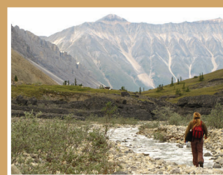
Fort Simpson is your gateway to the Nahanni. Make sure to stop off and take this once in a lifetime trip!