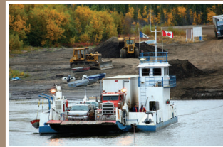
The Abraham Francis Ferry at Fort McPherson is free of charge and will take you across the Peel River.

There's only one road to Canada's Arctic and this magical highway takes you there. Across open tundra and at the foot of the Richardson Mountains, the vistas and landscapes will leave you speechless. At the end of the road is the charming town of Inuvik, a mix of Inuvialuit and Gwich'in cultures. Each July Inuvik plays host to the Great Northern Arts Festival. 2013 is a very special year as the festival celebrates its 25th anniversary.