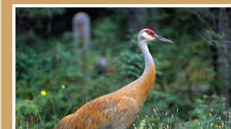
The endangered Whooping Crane nests near Wood Buffalo National Park. Keep your eyes peeled for them and Sandhill Cranes as well.