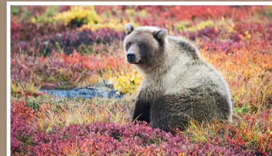
There is wildlife along the Dempster Highway. Take your time and you will spot caribou, moose, wolves, or even Grizzly Bears!