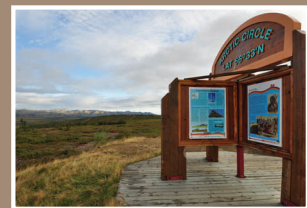
Stop at the Arctic Circle for a rest and a snack and enjoy the beauty of the tundra. Read about the geography and history of the region at the information kiosk and of course, take a photo!