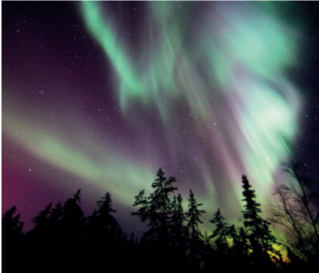
MAKI KAWAI / NWT TOURISM