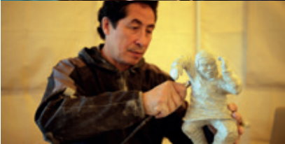
GEORGE FISCHER / NWTT

Warm mitts, hats and moccasins are some of the unique articles available in northern gift shops. Decorated with beadwork or moosehair tufting, they are one of a kind items handcrafted by northerners.