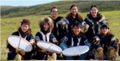
ZOE HO / NWTT