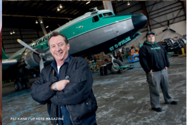
PAT KANE / UP HERE MAGAZINE