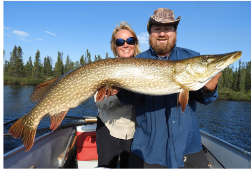
Big fish are plentiful at Scott Lake Lodge. (supplied)

PUBLISHED MARCH 22, 2018 UPDATED MARCH 26, 2018