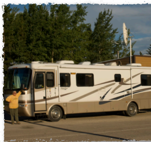
TERRY PARKER / NWTT

4 A chance to restock and replenish after hours of driving. There's a gas station and convenience store and, if it's getting late, a motel right next door.