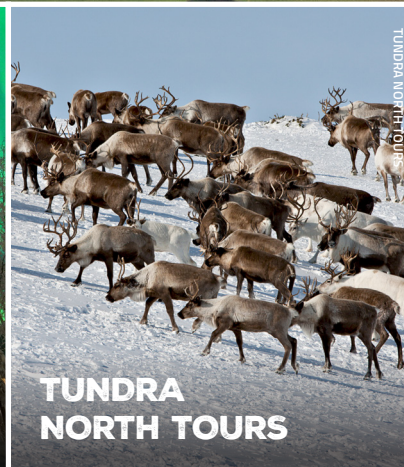
TUNDRA NORTH TOURS