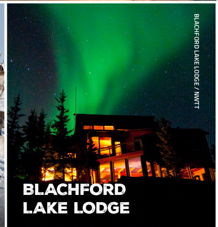
BLACHFORD LAKE LODGE / NWTT