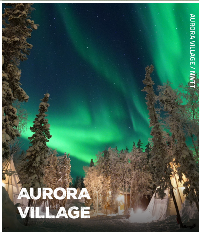
AURORA VILLAGE / NWTT