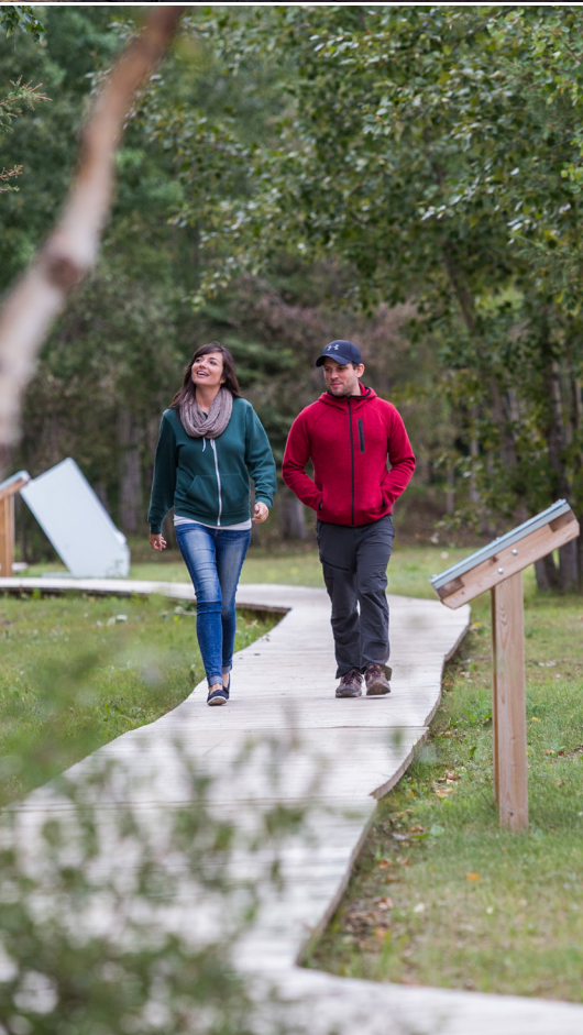
HAY RIVER TERRITORIAL PARK

For more information, visit www.fortsmith.ca/visitors .