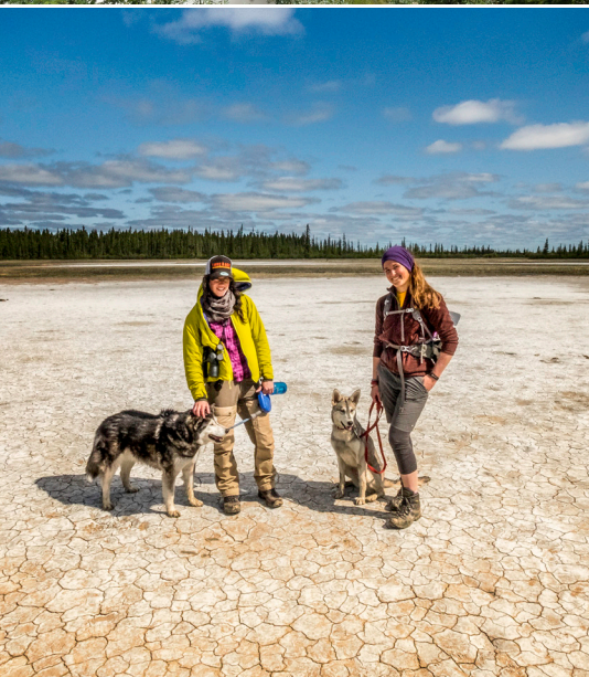
SALT PLAINS - PIERRE CHAILION/NWTT

Salt Plains Access (350m, moderate): At the Salt Plains Viewpoint, at the end of a turnoff from Highway #5, a switchback trail leads you to the sprawling salt plains. Salt abounds! Explore salt mounts and saline springs on this surreal landscape, or follow a set of bison tracks wherever they may lead you.