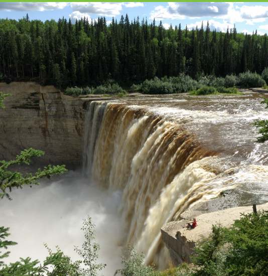
ALEXANDRA FALLS

Whether you're in the towns of Hay River or Fort Smith, or spending some time in Wood Buffalo National Park or Twin Gorge Territorial Park, the South Slave Region of the Northwest Territories is home to scenic and rewarding hiking trails that will delight both the casual nature lover and the avid outdoorsperson.