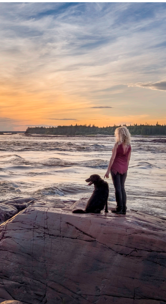
SLAVE RIVER RAPIDS