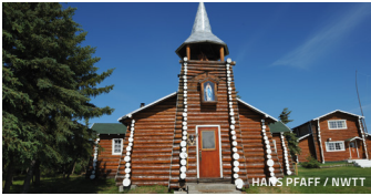
HANS PFAFF / NWT

The iconic and culturally significant NWT landmark is said to be the site of where Yamoria, law-giver of Dene lore, killed three giant beavers that terrorized Dene hunters.