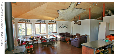
YELLOWKNIFE OUTDOOR ADVENTURES

Enjoy the spectacular Aurora from our private, cozy cabin. Take a break and dine on hot local fish chowder and bannock fresh from the oven by the warm fire and then sip on some hot chocolate or tea under the Northern Lights. ($69/person, without transportation; $89/person, with transportation.) Rent our cabin for your own private event ($500 for 8 hours; $350 for 6 hours.) Bonfires welcome!