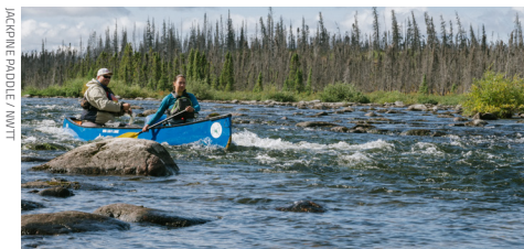
JACKPINE PADDLE / NWTT

Witness the magic of the Aurora in a private, intimate setting at our teepee camp, far from the city lights. Enjoy the warm, crackling fire inside a teepee as your Indigenous guide tells stories of their ancestors. We take free professional photos of you with our teepees under the Aurora or we can help you take your own. We specialize in small groups with limited seating each night, so book early!