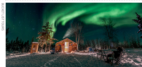
BUCKET LIST TOURS

It's never too early to start thinking of summer. Take advantage of our early bird special and book your spot on a certified-paddling course, a youth paddling camp, or fully-guided trip. Canoe or kayak, novice to advanced: we want to make your paddling dreams come true, whether it's exploring the East Arm of Great Slave Lake or the Keele River in the Mackenzie Mountains. Risk-free cancellations and flexible re-bookings.