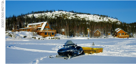
YELLOW DOG LODGE

We provide a licensed fishing guide and all the gear you need for a true Yellowknife ice fishing experience. You get to catch the fish and have all the fun! You'll stay warm and comfortable in our heated transportation as we ride out to our heated fishing tent. Perfect for anglers of all skill levels or the whole family, half-day trips start at $499 plus tax for four-person groups.