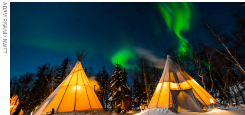
ADAM PISANI / NWTT

Located on Akaitcho Bay, on the shores of Great Slave Lake just outside of Yellowknife, B. Dene Adventures is home to world-class Aurora viewing. Relax in our warm cabin and enjoy cultural storytelling, as well as hands-on traditional knowledge and arts demonstrations led by expert Yellowknives Dene guides who are Indigenous to this land.