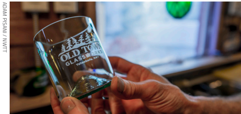
ADAM PRISAU / NWTT

Yellow Dog Lodge is ready to host your next Northern weekend staycation! Get here by snowmobile on our backcountry trails or fly in with our partner Ahmic Air. Between March 1 and April 15, book a stay at one of two private cabins or our deluxe cabin, where you will stay nice and cozy after a day of ice fishing, cross-country skiing or snowshoeing. For more info, visit yellowdoglodge.ca .