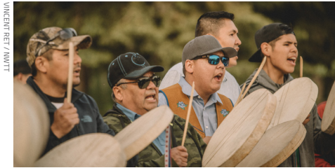
VINCENT REY / NWTT