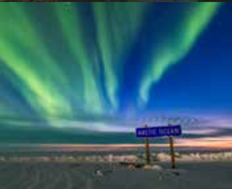
ARCTIC OCEAN