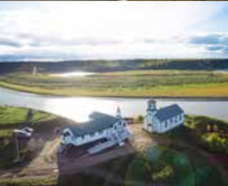
TSIIGHTCHIC, COULIN FIELD / N.W.T.