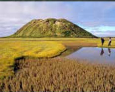
PINGO CANADIAN LANDMARK