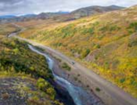
DEMETER HIGHWAY, COULIN FIELD / N.W.T.