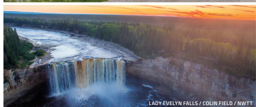
LADY EVELYN FALLS / COLIN FIELD / NWTT