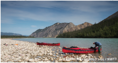
KEELE RIVER

Framed by four towering canyons, the river spills through the alpine habitat of bears, Dall's sheep and moose. Those who travel the Nahanni are rewarded with visits to legendary landmarks, any of which are as awe-inspiring as the river itself.