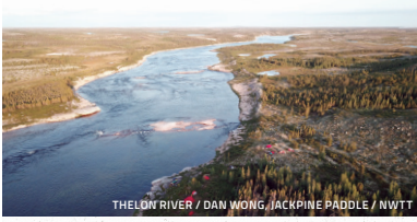
THELON RIVER / DAN WONG, JACKPINE PADDLE / NWTT

From the mouth of the Natla, the Keele slides through the fabled Mackenzie Range. The river is unbridged, untamed, rich in wildlife, and blissfully removed from the modern world. With a guide, the journey is suitable for all levels of canoeists.