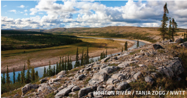
HORTON RIVER

The greatest of all Barrenland rivers rises just east of Great Slave Lake and flows through the Thelon Game Sanctuary - home to muskox, sandy dunes, and glacial eskers! Guided trips are offered with access by air from Yellowknife or Fort Smith.