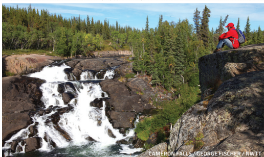
CAMERON FALLS

YOUR JOURNEY TO YELLOWKNIFE is sure to be filled with everything that exemplifies what makes the NWT spectacular - from territorial parks and day use areas to vibrant cultures and timeless landscapes. See colossal bison sauntering across the road, take in awe-inspiring majestic lakes and waterfalls, and be sure to take a detour into the communities of welcoming faces along the way. These are just some of the sights you can expect on the road to Yellowknife, where the vibrant and cultured capital of the Northwest Territories awaits!