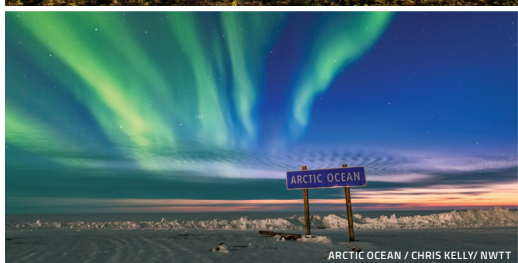
ARCTIC OCEAN

IF YOU LOVE A GOOD ROAD TRIP, THERE IS NO BETTER DESTINATION THAN THE TOP OF THE WORLD – RIGHT HERE IN THE NWT.