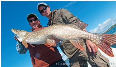
YELLOWKNIFE / J.F. GORGEON / NWT

THE NWT IS A WATER WORLD , with innumerable lakes dotting the landscape, home to some of the biggest and healthiest freshwater fish populations on Earth.