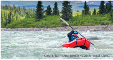
SOUTH NAHANNI RIVER

The NWT is a world of waterways and a haven for anyone who has dreamed of a life-changing paddling adventure.