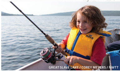
GREAT SLAVE LAKE / COREY MYERS / NWT