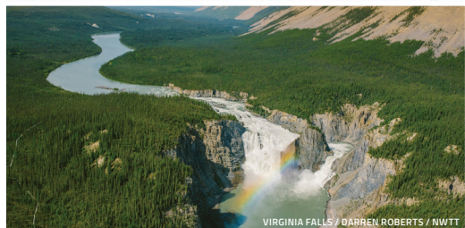
VIRGINIA FALLS

SEE VAST TRACTS OF WILDERNESS studded with small communities perched at the edge of massive rivers and lakes. Cross three of Canada's largest river systems: Peace, Liard and Mackenzie. This trip provides unlimited potential to delve deep into the North's culture, stunning landscapes, and outdoor adventures. Be sure to visit the first-ever World UNESCO Heritage Site by taking a flightseeing tour of the Nahanni National Park Reserve.