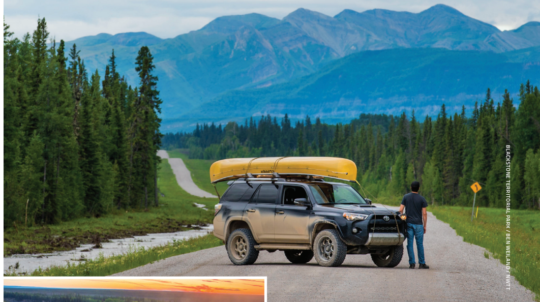
BLACKSTONE TERRITORIAL PARK / BEN WELAND / NWTT

READY FOR A FANTASTIC TRIP THROUGH SPECTACULAR MOUNTAINS, RIVERS AND LAKES?