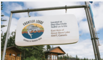
PAT KANE / NWTT