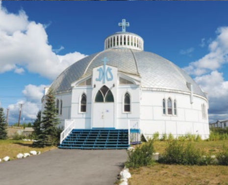
IGLOO CHURCH, HANS PRAEF / NWTT