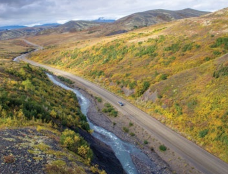
DEWSTER HIGHWAY, COULIN FIELD / NWTT