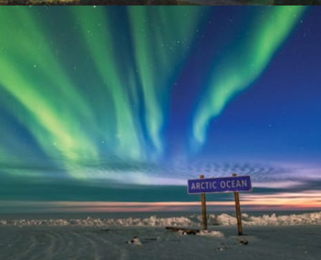
ARCTIC OCEAN