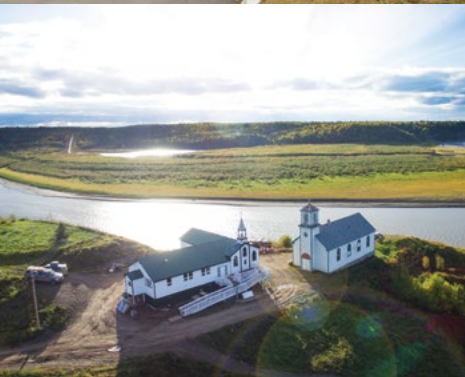
TSIGEHTCHIC, COULIN FIELD / NWTT