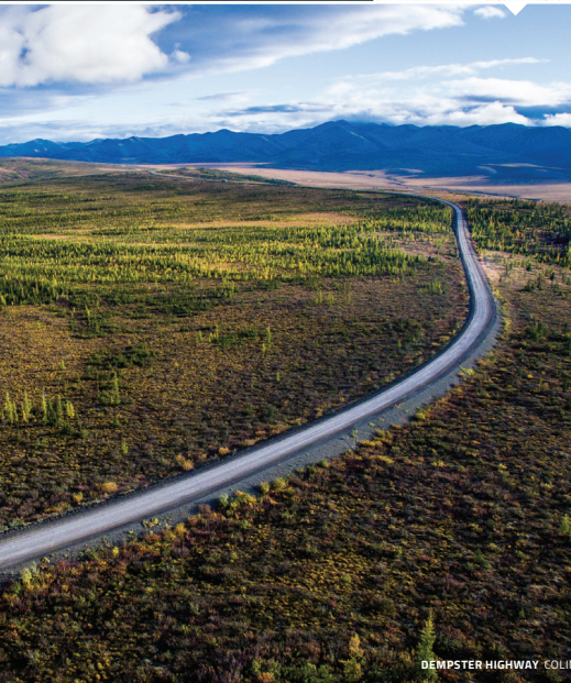
DEMPSTER HIGHWAY

and thread through rugged mountains and radiant Tundra. Traverse two rivers as you head to Inuvik and then on to Tuktoyaktuk and the Arctic Ocean. Drive through some of the most remote wilderness scenery in North America and feel the freedom of truly wide-open spaces.