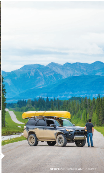
DEHCHO BEN WEILAND / NWTT