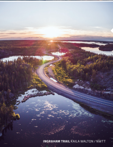
INGRAHAM TRAIL KAILA WALTON / NWT