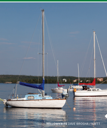
YELLOWKNIFE DAVE BROSHA / NWT