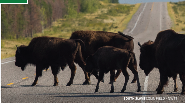
SOUTH SLAVE COLIN FIELD / NWT