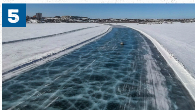
JASON SIMPSON / NWTT

Up here, our traffic jams look a little different. Keep your eyes peeled for herds of hulking bison on the highway.