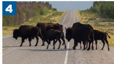
COLIN HEDD / NWTT

Each year, a team of dedicated artists and builders erect a giant snow castle on Yellowknife Bay, an architectural wonder for kids of all ages to enjoy.