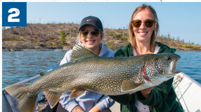
COREY MEYERS / NWTT