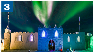
MARTIN WALE / NWTT

Great Slave Lake is a freshwater paradise. Jig for feisty Northern Pike through the ice, check nets for Burbot, or cast for Lake Trout and Arctic Grayling.